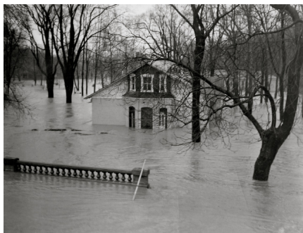
Covered baths in 1936 flood

Funding for the exhibit came from the WV Humanities Council and the Washington Heritage Trail.