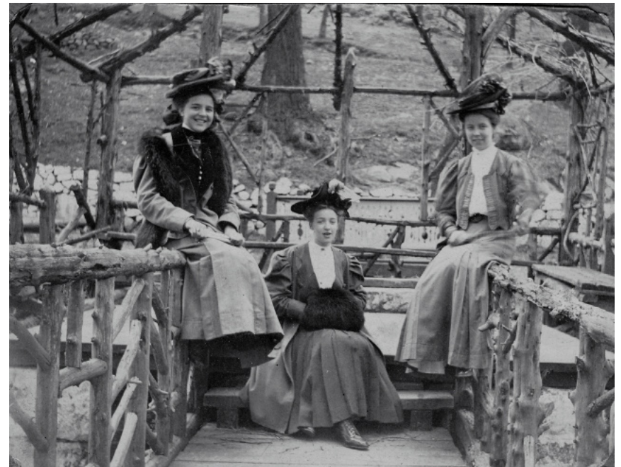
A Sunday afternoon in the Park circa 1910

The Museum of the Berkeley Springs is an educational center devoted to discovering, portraying and preserving the natural and human history of the springs and the surrounding area. A non-profit, membership organization founded in 1984, the Museum occupies the top floor of the two-story Roman Bath House, one of the buildings of Berkeley Springs State Park and on the National Register of Historical Places.